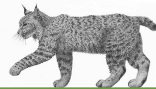
illustration: Barbara Smullen

HARRIS CENTER FOR CONSERVATION EDUCATION