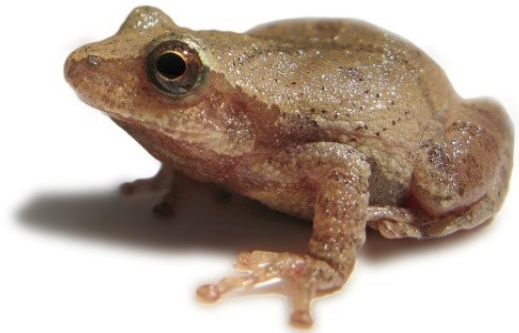
spring peeper

We provide Site Coordinators with field equipment and support, and remain in close communication with them throughout the salamander season.