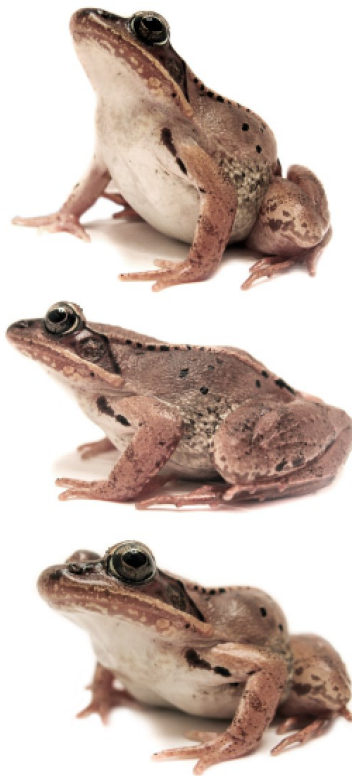
wood frog

There may also be times when you encounter injured animals. Amphibians are resilient and can recover from minor injuries, so if the wound is to the leg or tail, move the animal off the road and include it in your "live" count. Injuries to the head or core body are likely fatal; those animals should be counted among the dead.