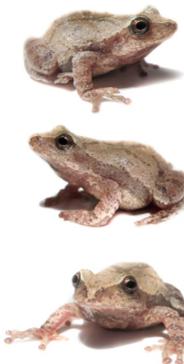
spring peeper

Salamanders and frogs are sensitive to chemicals and readily absorb toxins through their skin, so make sure your hands are free of insect repellent, lotion, soap, and perfume before handling amphibians. If you're using a bucket, rinse it thoroughly to eliminate any residue from soap, detergent, or other cleansers.