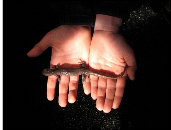
Jefferson salamander

In 2009, the City of Keene bought land that was previously slated for development to protect the migratory amphibian corridor at our popular