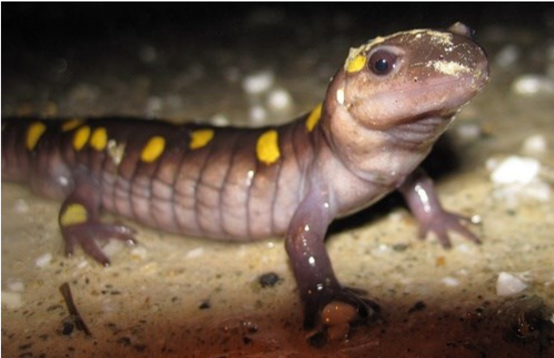
spotted salamander

This handbook has been adapted from materials created by the Bonnyvale Environmental Education Center in Brattleboro, Vermont.