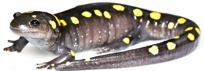
Jefferson (l) and spotted (r) salamander