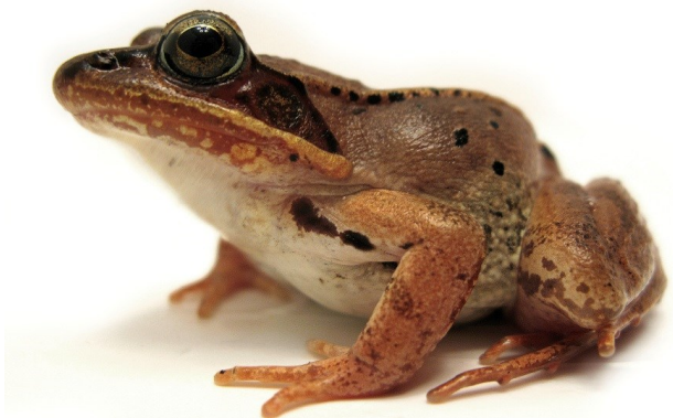
wood frog

Scan both sides of the road for frogs and salamanders, both live and dead. You'll see frogs and toads leaping or sitting still, impersonating tiny, tipped-up pyramids. Salamanders will look like sticks with one upturned end. They are often stunned by headlights, and may not move until you come to them.