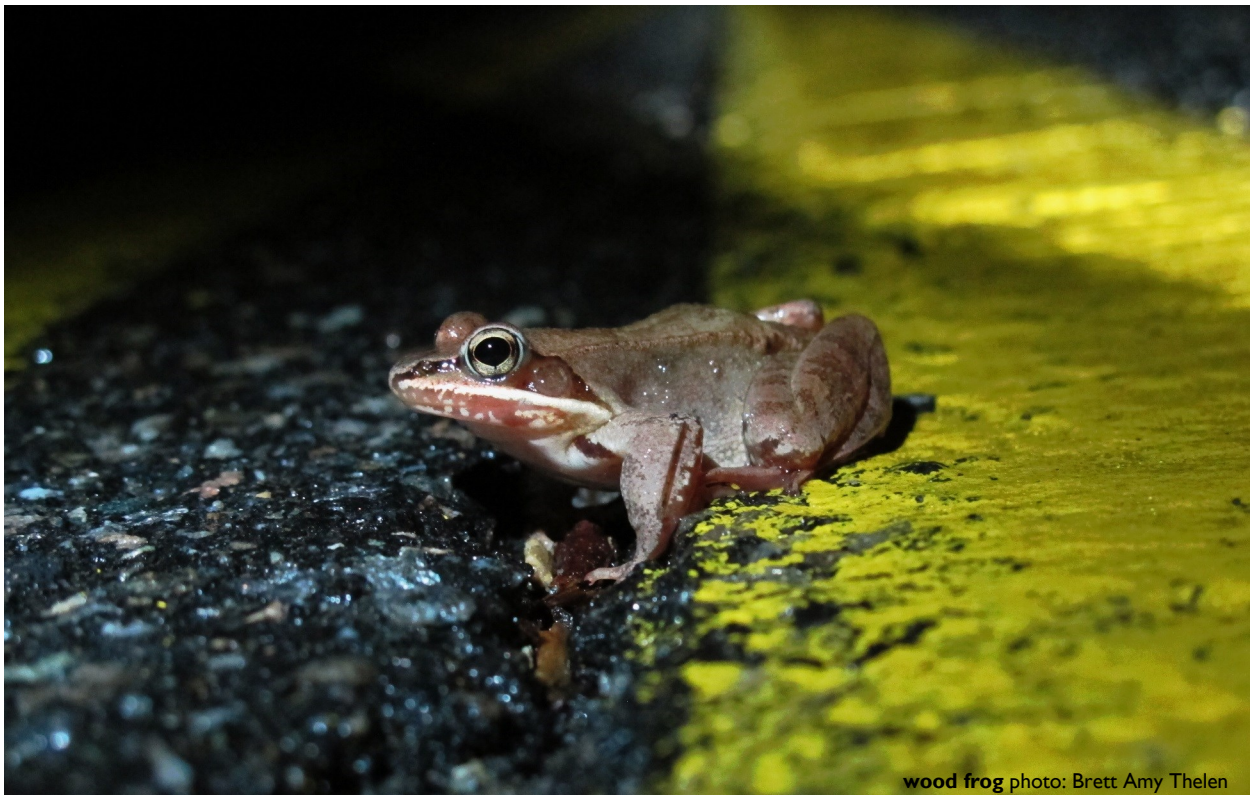
wood frog

For more detailed information on the locations of known amphibian crossing sites in southwest New Hampshire, visit harriscenter.org .