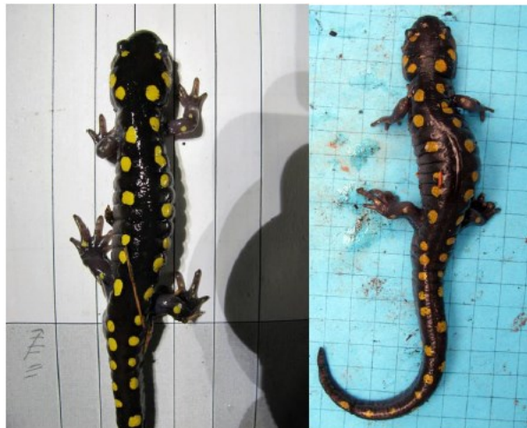
This spotted salamander was photographed on its inbound migration on 4/11/14 (left) and its outbound migration on 4/27/14 (right). Note the distinctive spot pattern on the head and upper back, which is unique to this individual.

approximately 600 x 900 pixels each: bigger than a thumbnail, smaller than a poster! If you don't know the first thing about re-sizing photos, just send them along as is, and we'll make them work.