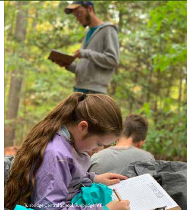
Tunbridge Central School, Tunbridge, VT

Our perspective is rooted in current understandings of the COVID-19 virus and a review of the literature on child development, the benefits of nature-based learning, and mental health resilience.