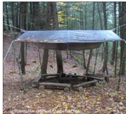
Wild Roots Nature School, Chesterfield, NH

Alternate indoor periods with outdoor blocks of 60 minutes or more. Beyond the healthy option of free-play, activities might rotate between a variety of experiences connected to academic studies and community needs. Project-based learning, trail walking, “sit-spot” mindfulness, gardening, community service projects, scavenger hunts, birding, water investigations, obstacle courses or exercise circuits might be some of the options over time.