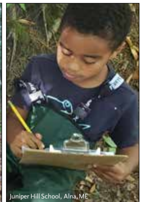
Juniper Hill School, Alna, ME