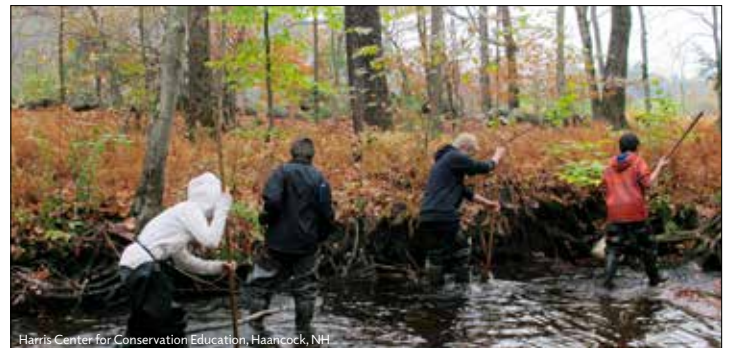
Harris Center for Conservation Education, Hancock, NH

These short documentary films bring nature-based education to life: