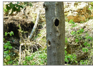
Hollow tree for winter den