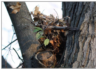
Squirrel nest (from summer)