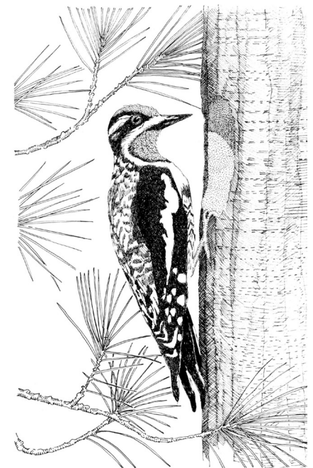
illustration © Janet Bleicken

All are welcome here, regardless of race, ethnicity, ability, religion, gender identity, or sexual orientation. Please respect this living landscape and all who share it with you.