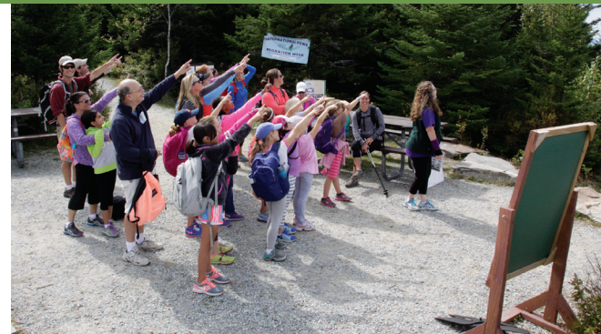
Harris Center teacher-naturalists introduce students to the excitement of hawkwatching.