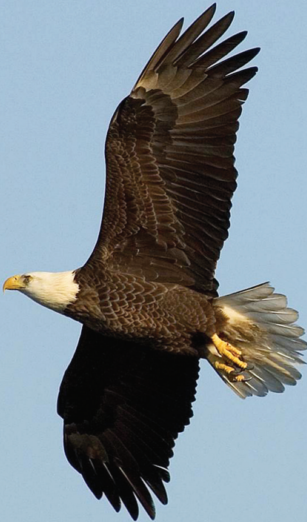
Miller State Park Peterborough, New Hampshire