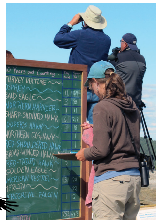
Hawk counter updates the daily tally.

Raptors are particularly good indicators of environmental health because they inhabit most ecosystem types, occupy large home ranges, feed at the top of the food web, and are highly sensitive to chemical contamination and other human disturbance. Spring and fall are ideal times to collect data on raptors because they congregate during migration along coastlines, prominent mountain ridges, and river valleys, making it easy to tally them. Conducting standardized long-term counts of migrating raptors can provide important information on their migration patterns and behaviors, as well as changes to their populations.