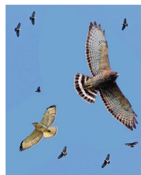
A Kettle of Broad-winged Hawks