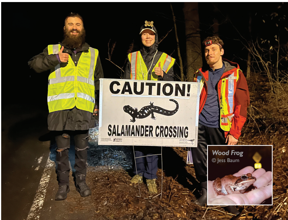
Wood Frog