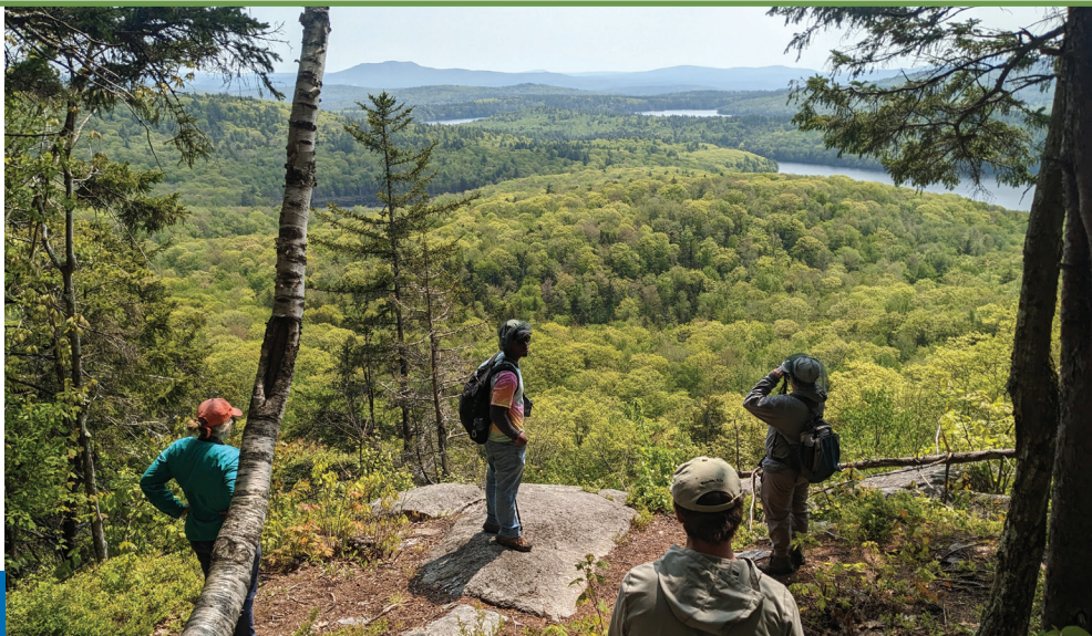
▲ An Internship with a View The 2023 conservation internship team takes in the view while documenting trail conditions in the Harris Center’s trail network.